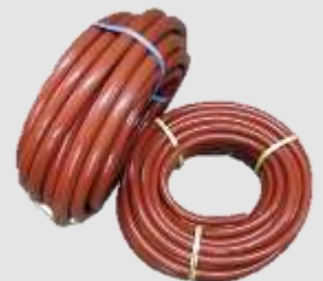
19mm & 20mm Hose Reel Tubing