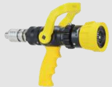
Attack 100-Pro Series Nozzle