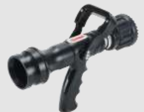
H500 Mid-Range Nozzle