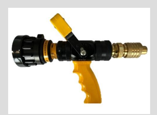
H500 ST Nozzle