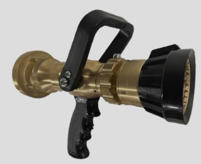
Marine Attack 500 Nozzle