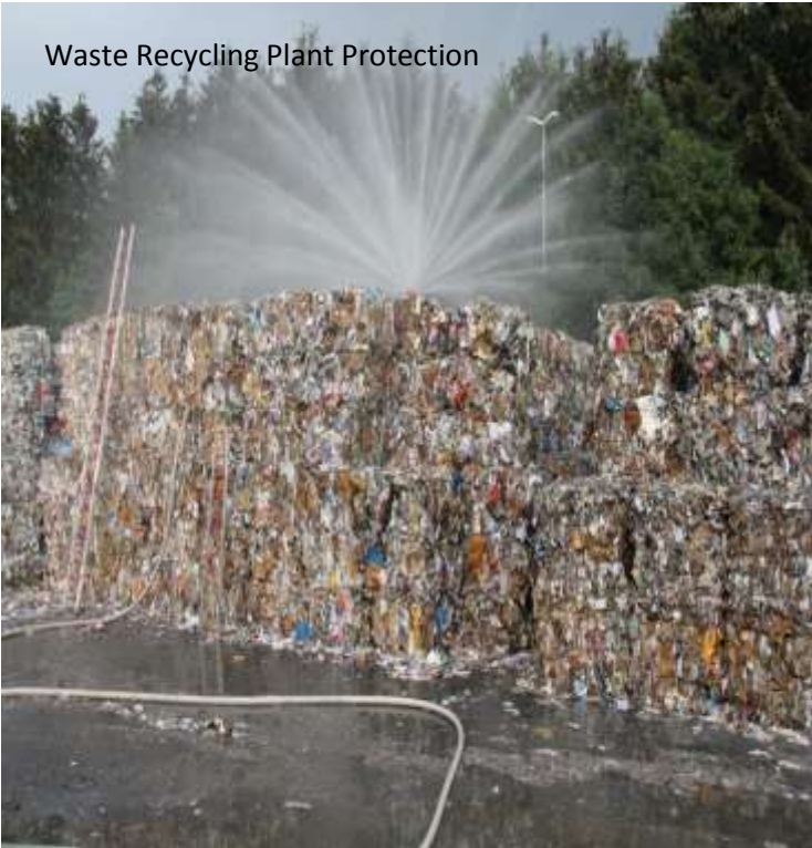
Waste Recycling Plant Protection