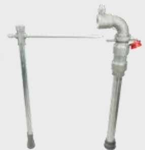
Key & Bar Sets