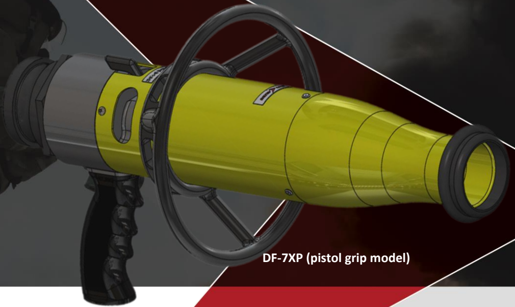
DF-7XP (pistol grip model)