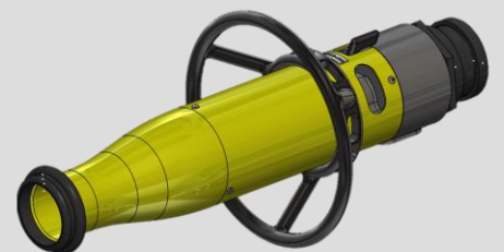
DF-7X model (without pistol grip)