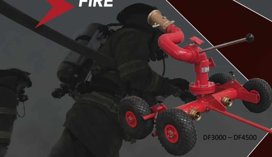
DF3000 – DF4500