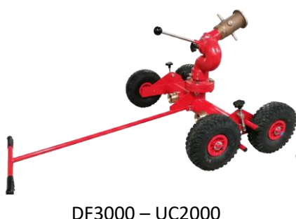
DF3000 – UC2000