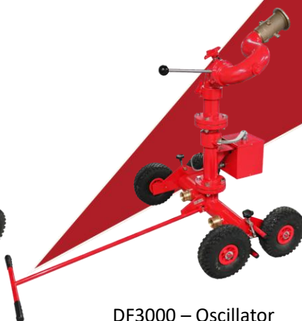
DF3000 – Oscillator